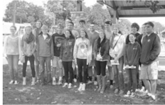
Youth Advisory Council

Yearly, we reach out to area teachers, coaches and school counselors for nominations of students to the Mayor’s Youth Advisory Council. This year’s group consisted of 31 students; 12 from Marian High School, 14 from Mishawaka High School, and 5 from Penn High School. The year was started with the annual “Fiesta in the Park” where students and their families were invited to meet the Mayor and the Youth Council Adult Coordinators and talk about what the new year of Youth Council would bring. This year’s Swearing in Ceremony was held during the Common Council meeting on September 21 st and during their first business meeting, later that evening, Youth Council Officers were selected: