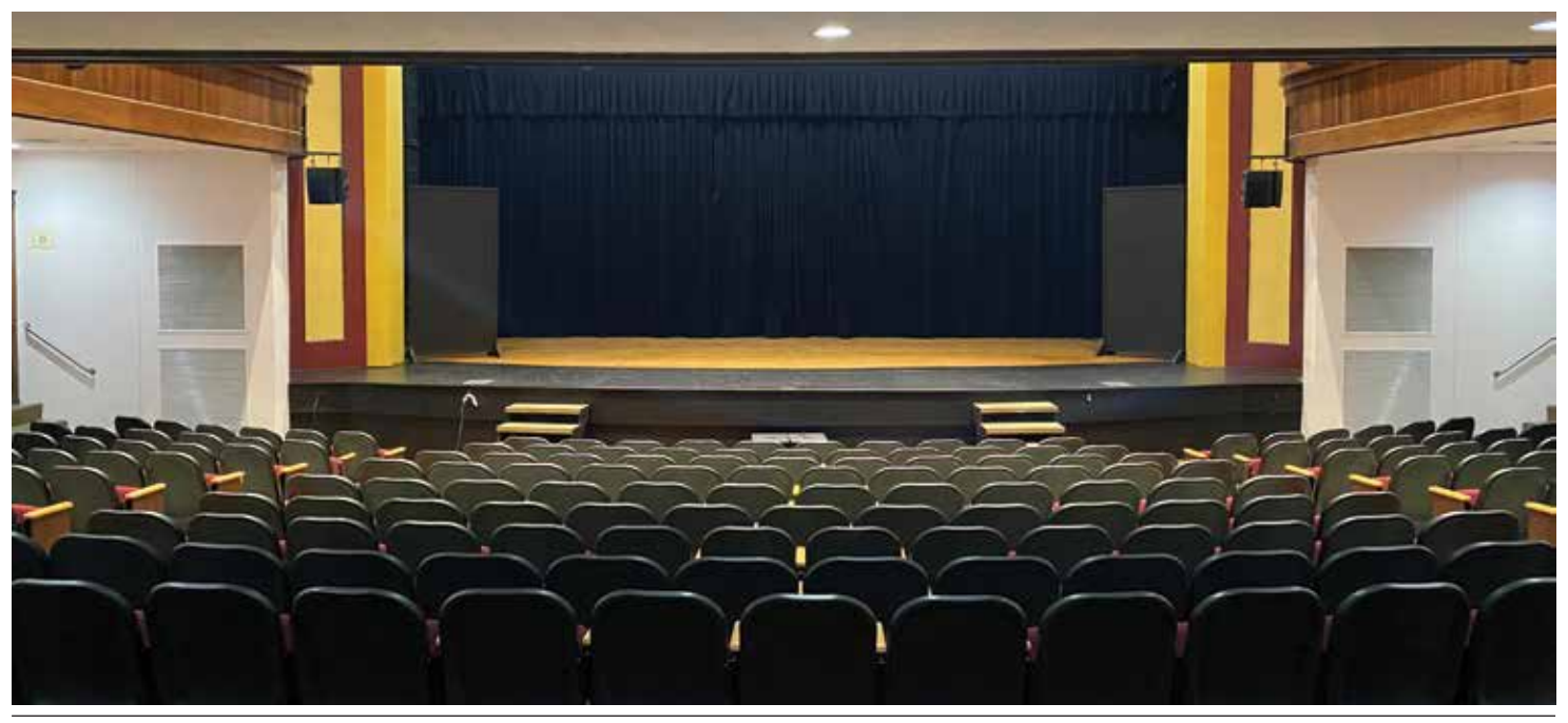
*Note: Fees are subject to change without prior notice. Additional fees may be required.